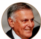
Research Prof. Dan Schechtman Nobel Prize Laureate, Faculty of Materials Science & engineering