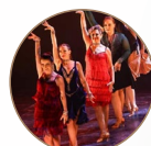
Spirit Dance Group Technion